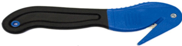
Polysafe Plus (H907 012 A03)