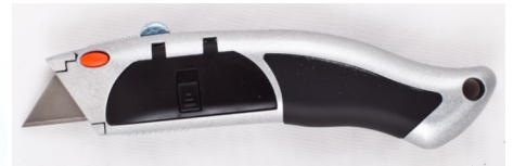
HT28 Easy Change (H028 002 X01)