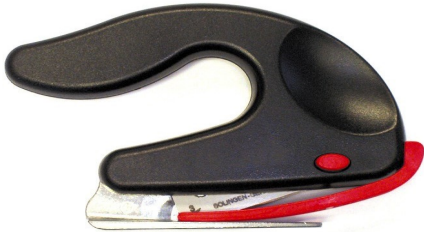
Polytrim (H030 001 A03)