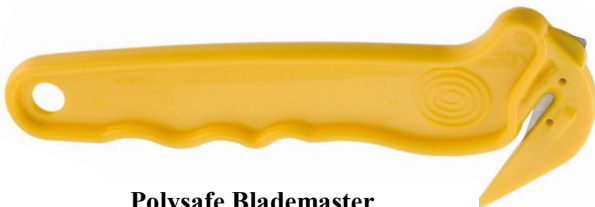
Polysafe Blademaster (H907 016 A03)