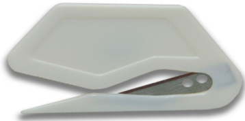
Polyslit (can be printed on) (H913 008 T03)

Below is a small selection from our inventory of hand knives, safety knives and replacement blades. Please call with your requirements: