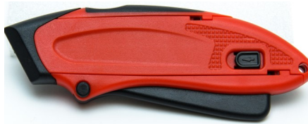
Auto-retracting squeeze safety knife (H032 001 A03)