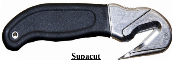
Supacut (H907 013 A03)